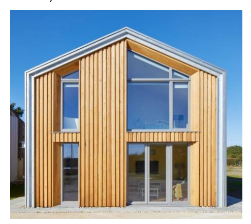
Ringmer Passivhaus, (Photo courtesy of Enhabit)