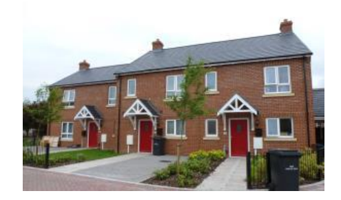
Hart Lea, Leicestershire.