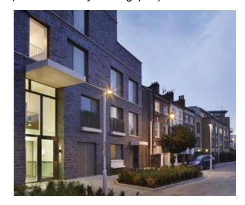
Agar Grove, Camden.